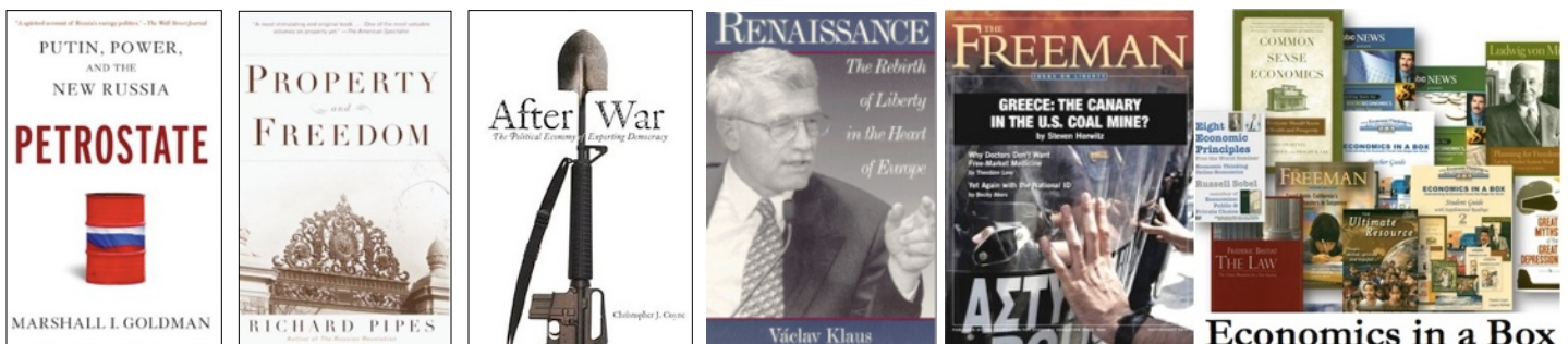
Economics in a Box